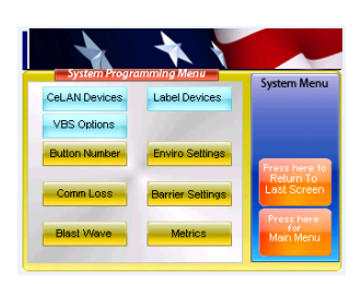
VBS System Menu